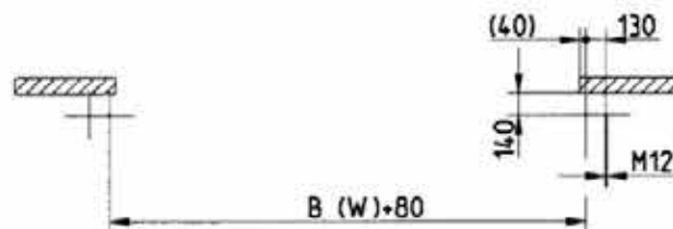
Fixing to floor